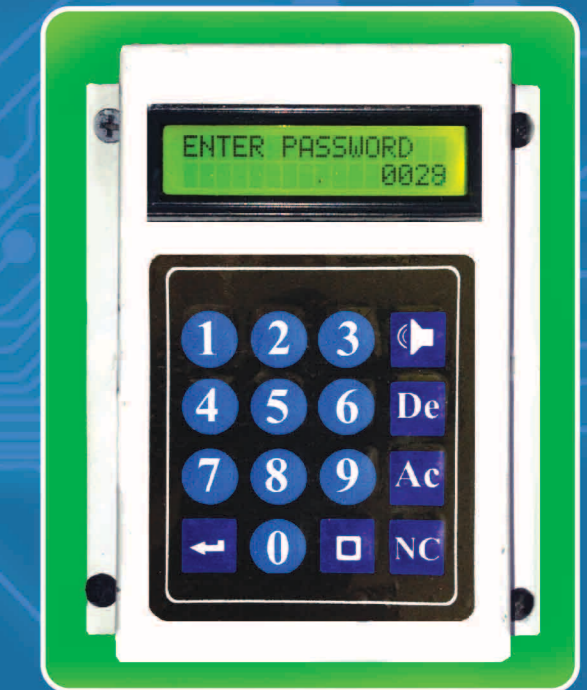
fig.1 exterior part

banks, offices, finances, hospitals, apartments, commercial markets, residence, etc.