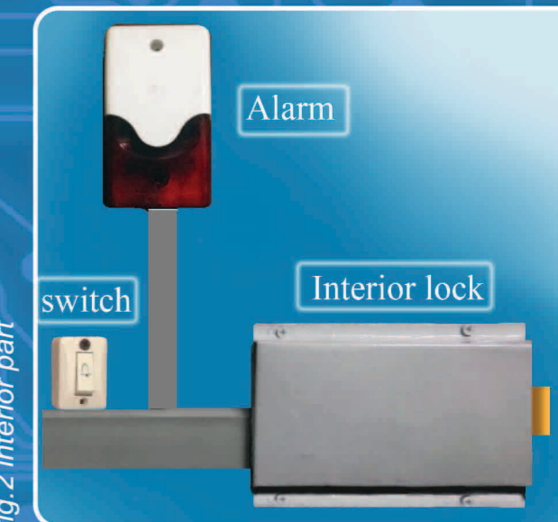
fig.2 interior part